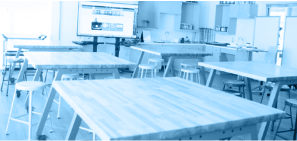
*As of October 2020