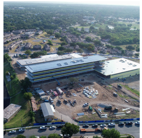
Eastside ECHS Aerial