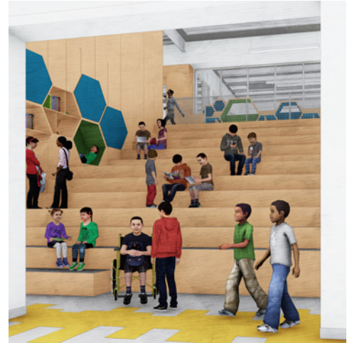
Sánchez ES Learning Stairs

The Sustainable Building Internship is just one example of how the 2017 Bond Program is unlocking new opportunities for our students. The modernized spaces themselves provide students the chance to explore their environments and learn more about what it means to build and maintain a sustainable facility.